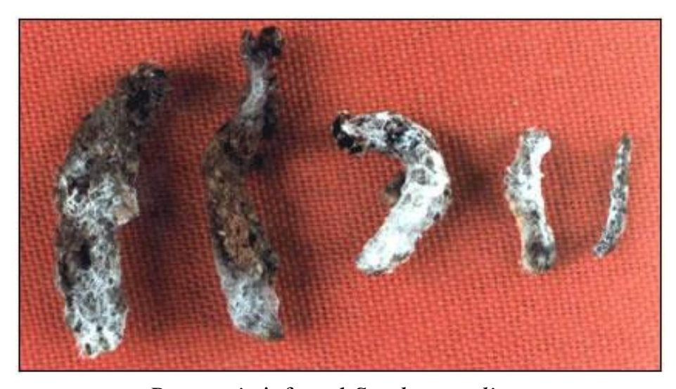
Beauveria infested Spodoptera litura